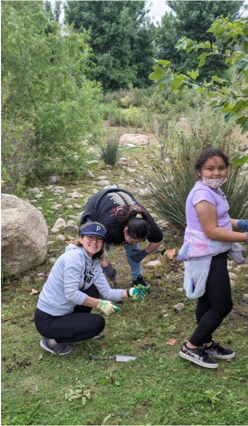
Flexible team players