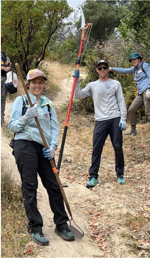
Passionate park supporters