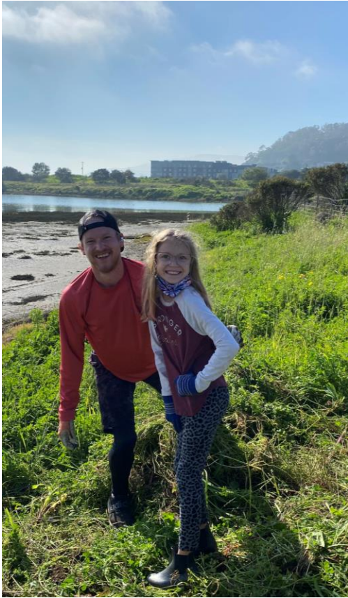
Builds community and a safe space for all