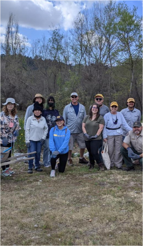
Shares knowledge and skills